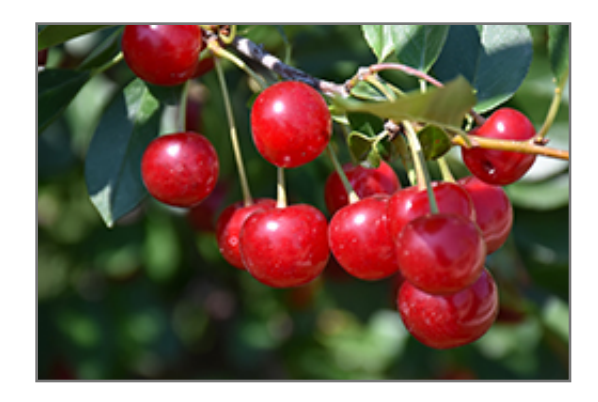
Valentine Cherry fruit

Valentine Cherry features showy clusters of fragrant white flowers along the branches in mid spring. It has green deciduous foliage. The glossy oval leaves turn yellow in fall. The fruits are showy cherry red drupes carried in abundance in late summer. The fruit can be messy if allowed to drop on the lawn or walkways, and may require occasional clean-up.