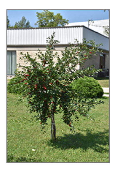
Valentine Cherry fruit