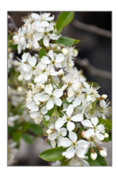
Valentine Cherry flowers

This shrub is typically grown in a designated area of the yard because of its mature size and spread. It should only be grown in full sunlight. It does best in average to evenly moist conditions, but will not tolerate standing water. It is not particular as to soil type or pH. It is highly tolerant of urban pollution and will even thrive in inner city environments. This particular variety is an interspecific hybrid.