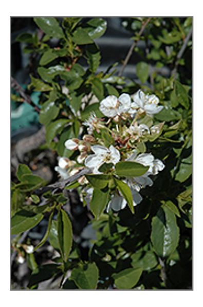
Romeo Cherry flowers