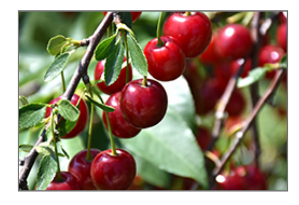
Romeo Cherry fruit

Romeo Cherry features showy clusters of fragrant white flowers along the branches in mid spring. It has green deciduous foliage. The glossy oval leaves turn yellow in fall. The fruits are showy crimson drupes carried in abundance in mid summer.