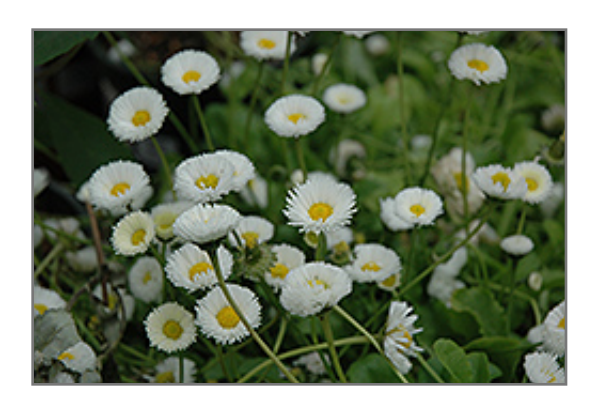
Rominette White English Daisy flowers