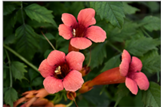
Flamenco Trumpetvine flowers

Flamenco Trumpetvine is a dense multi-stemmed deciduous woody vine with a twining and trailing habit of growth. Its average texture blends into the landscape, but can be balanced by one or two finer or coarser trees or shrubs for an effective composition.