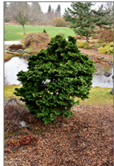
Dwarf Hinoki Falsecypress