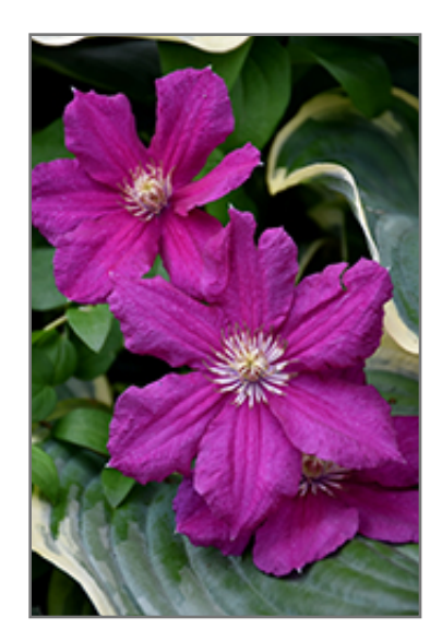
Ernest Markham Clematis flowers

Ernest Markham Clematis is recommended for the following landscape applications;