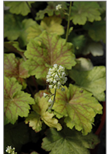
Electra Coral Bells flowers

Electra Coral Bells is recommended for the following landscape applications;