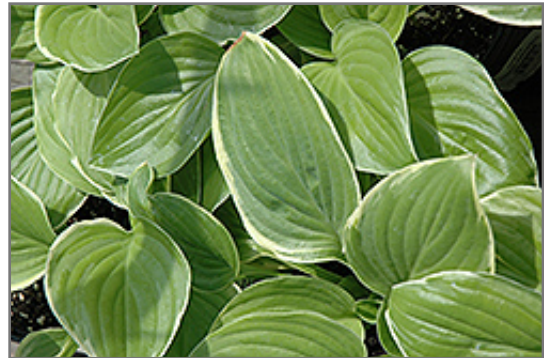
Frozen Margarita Hosta foliage