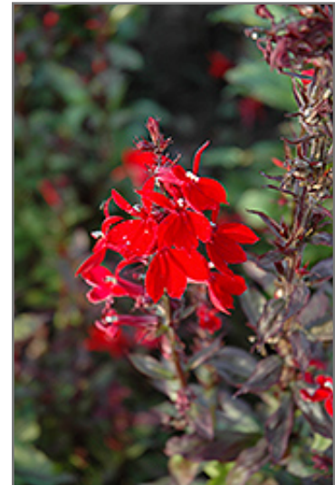
Queen Victoria Lobelia flowers