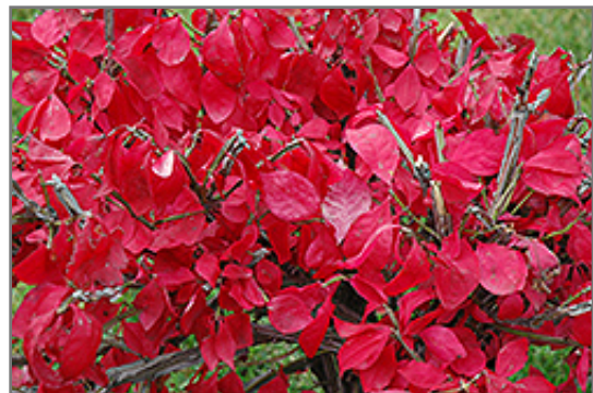
Compact Winged Burning Bush in fall