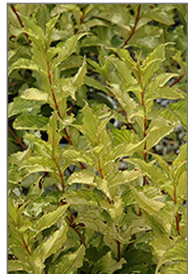
Ghost Weigela foliage