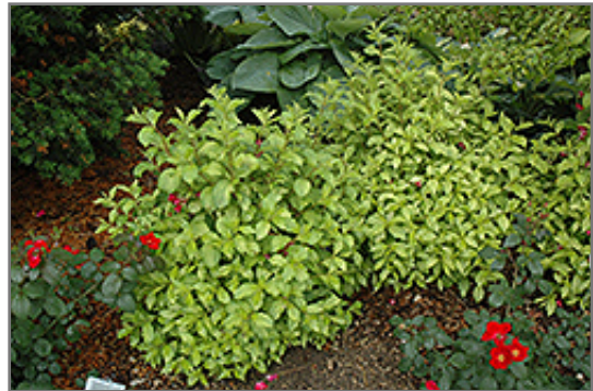
Ghost Weigela

This plant is not reliably hardy in our region, and certain restrictions may apply; contact the store for more information.