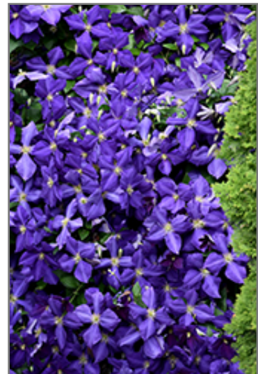
Jackmanii Clematis in bloom

Jackmanii Clematis is recommended for the following landscape applications;