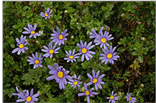
Blue Daisy flowers