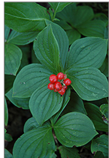
Bunchberry fruit