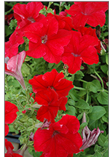
Dreams Red Petunia flowers