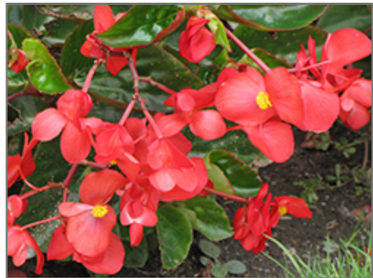
Dragon Wing Red Begonia flowers

Dragon Wing Red Begonia is an herbaceous annual with a trailing habit of growth, eventually spilling over the edges of hanging baskets and containers. Its medium texture blends into the garden, but can always be balanced by a couple of finer or coarser plants for an effective composition.