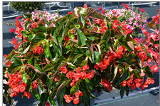
Dragon Wing Red Begonia in bloom

Dragon Wing Red Begonia is a fine choice for the garden, but it is also a good selection for planting in outdoor containers and hanging baskets. Because of its trailing habit of growth, it is ideally suited for use as a 'spiller' in the 'spiller-thriller-filler' container combination; plant it near the edges where it can spill gracefully over the pot. Note that when growing plants in outdoor containers and baskets, they may require more frequent waterings than they would in the yard or garden.