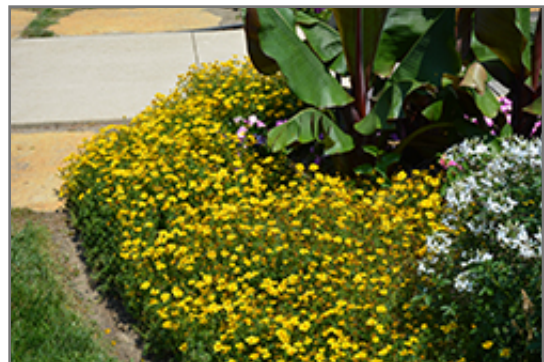
Goldilocks Rocks Bidens in bloom