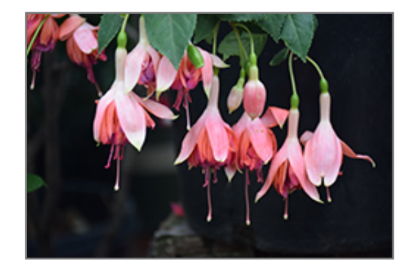
Bicentennial Fuchsia flowers