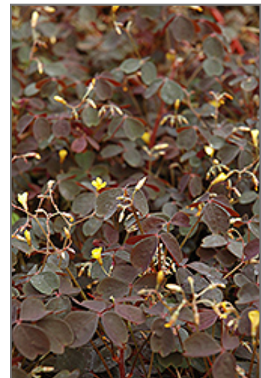
Burgundy Bliss Shamrock flowers