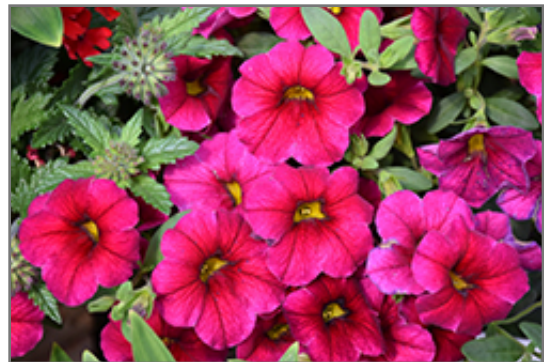
Superbells Cherry Red Calibrachoa flowers