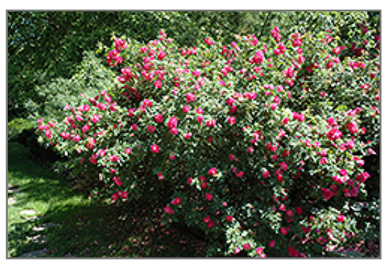
John Cabot Rose in bloom