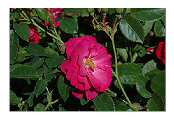
John Cabot Rose flowers