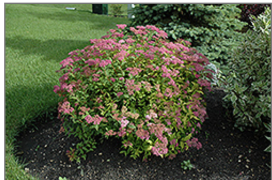
Goldflame Spirea in bloom