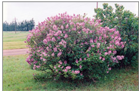
Miss Canada Lilac in bloom