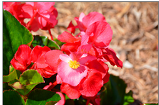
Whopper Rose Green Leaf Begonia flowers

Whopper Rose Green Leaf Begonia is an herbaceous annual with a mounded form. Its medium texture blends into the garden, but can always be balanced by a couple of finer or coarser plants for an effective composition.