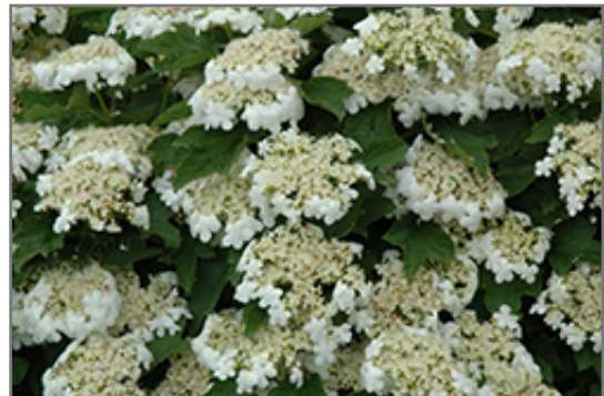
Compact European Cranberry flowers