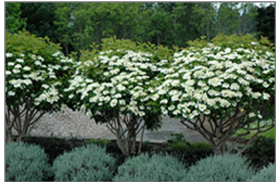
Compact European Cranberry in bloom

Compact European Cranberry is a dense multi-stemmed deciduous shrub with a more or less rounded form. Its average texture blends into the landscape, but can be balanced by one or two finer or coarser trees or shrubs for an effective composition.