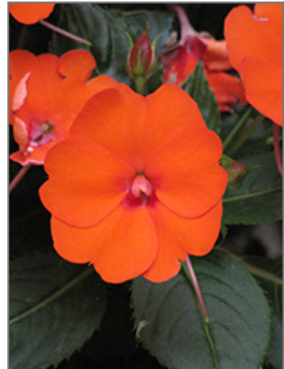
SunPatiens Compact Electric Orange New Guinea Impatiens flowers

SunPatiens Compact Electric Orange New Guinea Impatiens is a dense herbaceous annual with a mounded form. Its medium texture blends into the garden, but can always be balanced by a couple of finer or coarser plants for an effective composition.