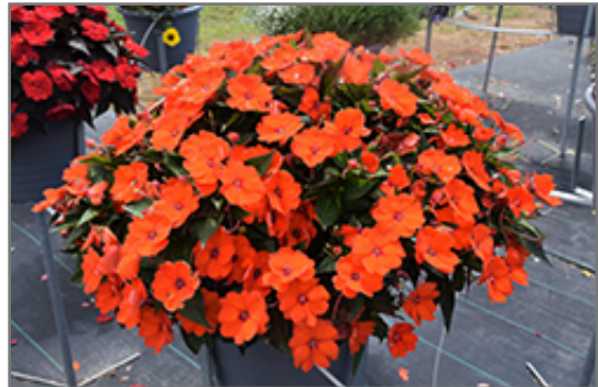
SunPatiens Compact Electric Orange New Guinea Impatiens in bloom

SunPatiens Compact Electric Orange New Guinea Impatiens is a fine choice for the garden, but it is also a good selection for planting in outdoor containers and hanging baskets. It can be used either as 'filler' or as a 'thriller' in the 'spiller-thriller-filler' container combination, depending on the height and form of the other plants used in the container planting. It is even sizeable enough that it can be grown alone in a suitable container. Note that when growing plants in outdoor containers and baskets, they may require more frequent waterings than they would in the yard or garden.