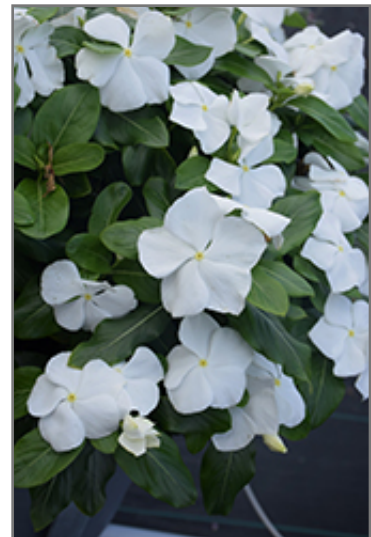
Titan Pure White Vinca flowers

This plant will require occasional maintenance and upkeep, and should not require much pruning, except when necessary, such as to remove dieback. It is a good choice for attracting butterflies to your yard, but is not particularly attractive to deer who tend to leave it alone in favor of tastier treats. It has no significant negative characteristics.