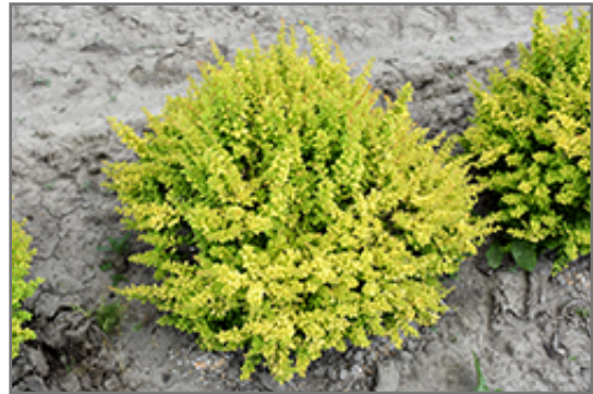
Sunsation Japanese Barberry