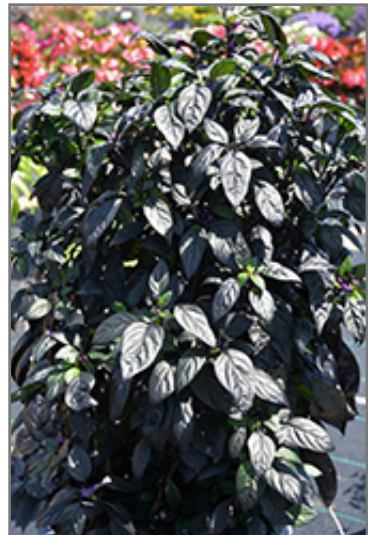
Black Pearl Ornamental Pepper