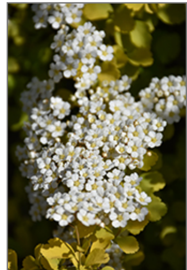
Glow Girl Birch Leaf Spirea flowers