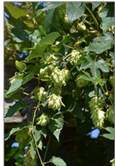
Hops fruit