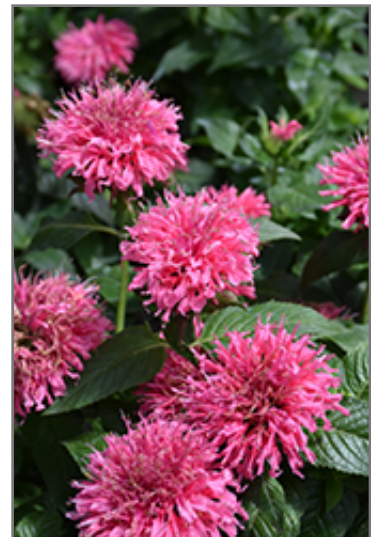
Bubblegum Blast Beebalm flowers

This plant will require occasional maintenance and upkeep, and should be cut back in late fall in preparation for winter. It is a good choice for attracting bees, butterflies and hummingbirds to your yard, but is not particularly attractive to deer who tend to leave it alone in favor of tastier treats. Gardeners should be aware of the following characteristic(s) that may warrant special consideration;