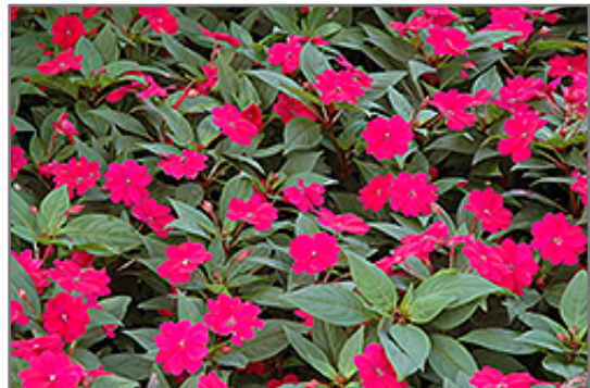
Bounce Cherry Impatiens in bloom