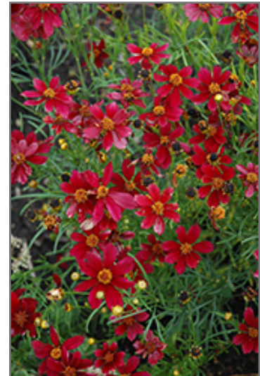
Red Satin Tickseed flowers

Red Satin Tickseed is recommended for the following landscape applications;