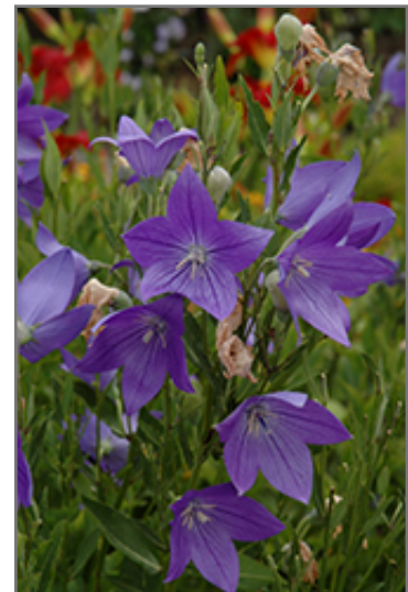
Fuji Blue Balloon Flower flowers