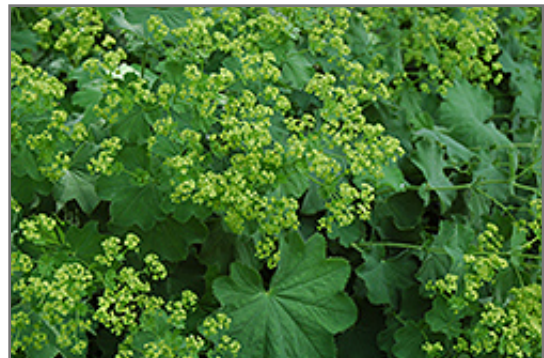
Lady's Mantle flowers

Lady's Mantle is recommended for the following landscape applications;