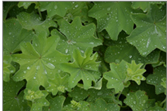
Lady's Mantle foliage

This plant performs well in both full sun and full shade. It is very adaptable to both dry and moist locations, and should do just fine under typical garden conditions. It is not particular as to soil type or pH. It is highly tolerant of urban pollution and will even thrive in inner city environments. This species is not originally from North America. It can be propagated by cuttings.