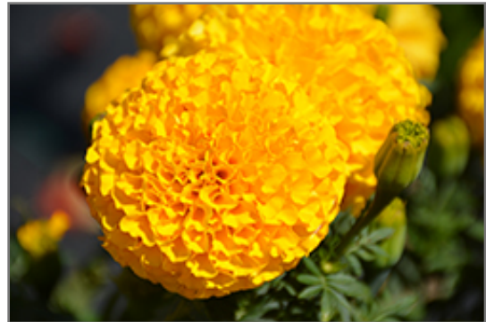
Taishan Gold Marigold flowers

This is a relatively low maintenance plant. Trim off the flower heads after they fade and die to encourage more blooms late into the season. Deer don't particularly care for this plant and will usually leave it alone in favor of tastier treats. It has no significant negative characteristics.