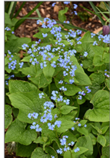
Siberian Bugloss flowers

Siberian Bugloss is recommended for the following landscape applications;