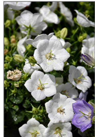
Rapido White Bellflower flowers

Rapido White Bellflower is recommended for the following landscape applications;