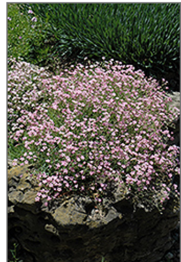
Pink Creeping Baby's Breath in bloom