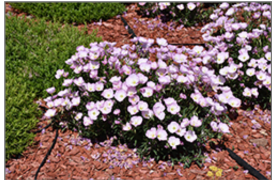
Twilight Evening Primrose in bloom

Twilight Evening Primrose is an herbaceous perennial with a ground-hugging habit of growth. Its medium texture blends into the garden, but can always be balanced by a couple of finer or coarser plants for an effective composition.