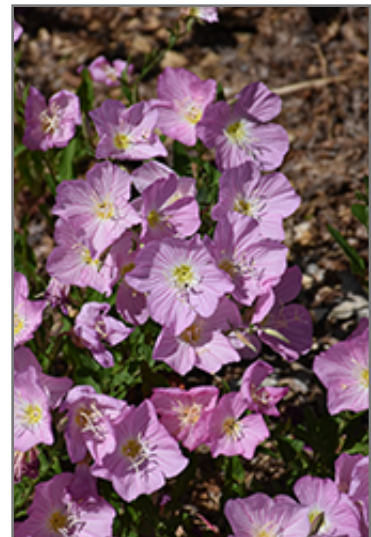
Twilight Evening Primrose flowers