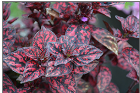
Hippo Red Polka Dot Plant foliage

Hippo Red Polka Dot Plant is recommended for the following landscape applications;