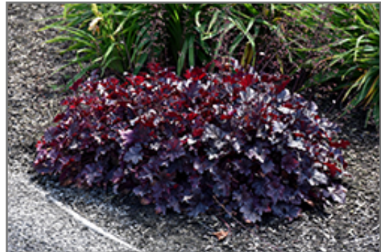
Plum Pudding Coral Bells

This plant is not reliably hardy in our region, and certain restrictions may apply; contact the store for more information.