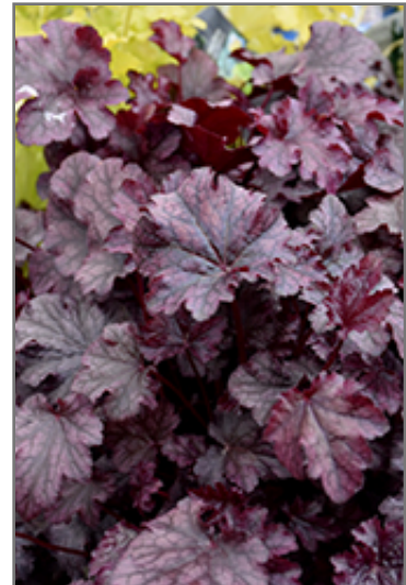
Plum Pudding Coral Bells foliage

This is a relatively low maintenance plant, and should be cut back in late fall in preparation for winter. It is a good choice for attracting hummingbirds to your yard. It has no significant negative characteristics.