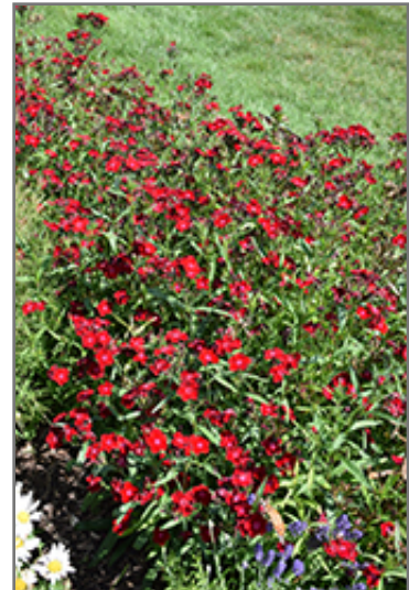
Rockin' Red Pinks in bloom

This plant is not reliably hardy in our region, and certain restrictions may apply; contact the store for more information.