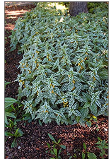
Hermann's Pride Yellow Archangel in bloom