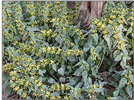
Hermann's Pride Yellow Archangel in bloom

This plant does best in partial shade to shade. It is an amazingly adaptable plant, tolerating both dry conditions and even some standing water. It is considered to be drought-tolerant, and thus makes an ideal choice for a low-water garden or xeriscape application. It is not particular as to soil type or pH. It is highly tolerant of urban pollution and will even thrive in inner city environments. This is a selected variety of a species not originally from North America. It can be propagated by division; however, as a cultivated variety, be aware that it may be subject to certain restrictions or prohibitions on propagation.