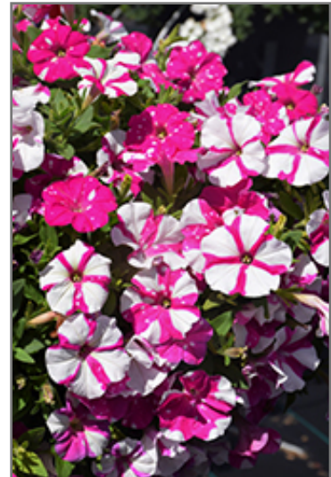
Headliner Pink Sky Petunia flowers

Headliner Pink Sky Petunia is recommended for the following landscape applications;