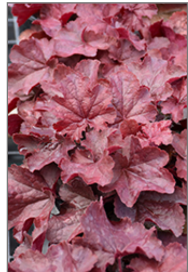
Northern Exposure Red Coral Bells foliage

Northern Exposure Red Coral Bells is recommended for the following landscape applications;