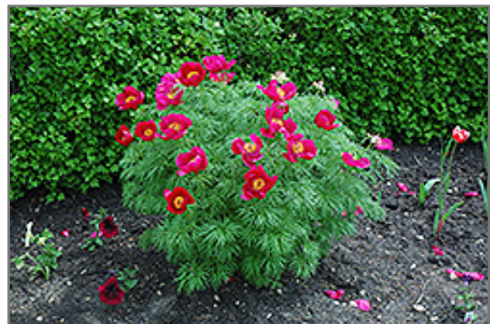
Fernleaf Peony in bloom