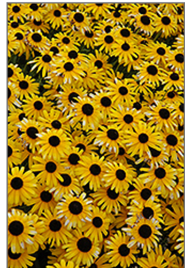
Viette's Little Suzy Coneflower flowers