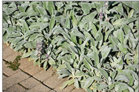
Lamb's Ears

Lamb's Ears is a fine choice for the garden, but it is also a good selection for planting in outdoor pots and containers. It can be used either as 'filler' or as a 'thriller' in the 'spiller-thriller-filler' container combination, depending on the height and form of the other plants used in the container planting. Note that when growing plants in outdoor containers and baskets, they may require more frequent waterings than they would in the yard or garden. Be aware that in our climate, most plants cannot be expected to survive the winter if left in containers outdoors, and this plant is no exception. Contact our experts for more information on how to protect it over the winter months.