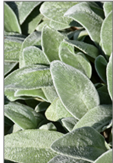
Lamb's Ears foliage